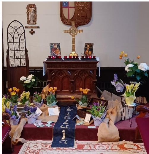
St. Mark's own miniature Garden of Gethsemane at the foot of the Altar of Repose

St. Mark's Episcopal Church 134 N. Division Ave Grand Rapids, MI 49503 www.stmarksgr.org 616.456.1684