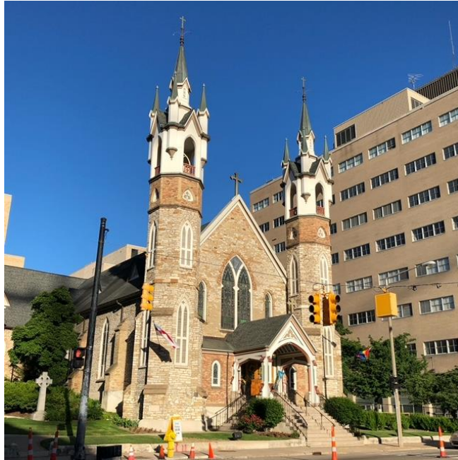
St. Mark's Church, begun in 1848

(In-Person and 10:30 Live-Streamed on Facebook and YouTube)